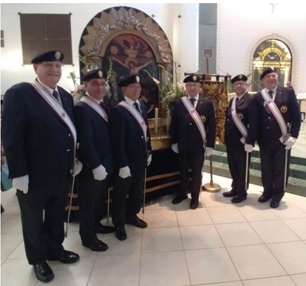
Lord of Miracles (Señor de los Milagros) Mass