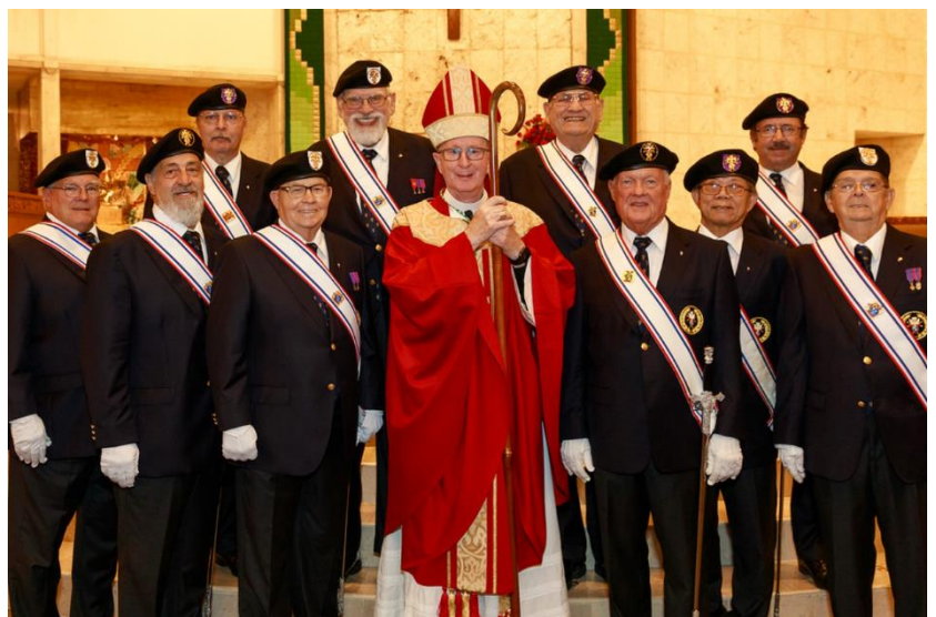
Confirmation Mass St. Brendan's