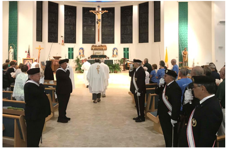
Dedication Mass for new Chapel Tabernacle