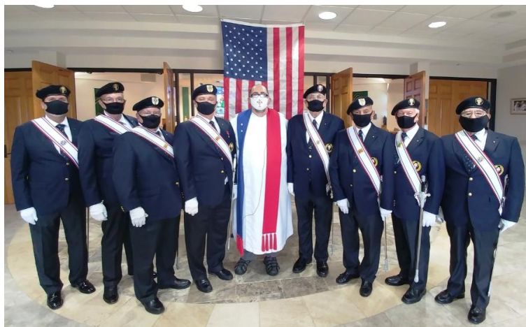
4 th of July Patriot's Mass