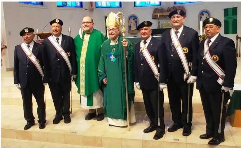
SMdM Confirmation Mass