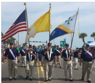
2019 Flagler Beach Parade

On July 4th , the Continental Congress formally adopted the Declaration of Independence, which had been written largely by Jefferson. Though the vote for actual independence took place on July 2nd , from then on the 4th became the day that was celebrated as the birth of American independence. Dec 16, 2009