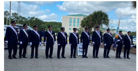
Flagler County Memorial Day