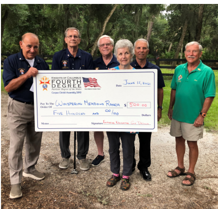
Left Picture $500 Donation to Whispering Meadows Ranch