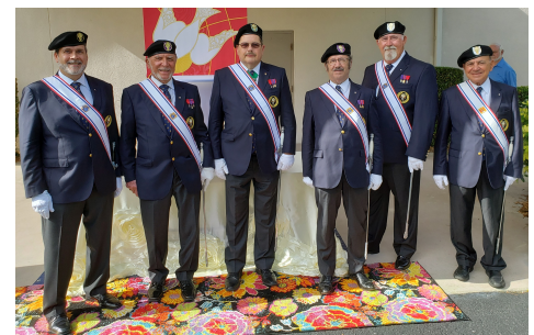
Corpus Christi St. Mary's Church