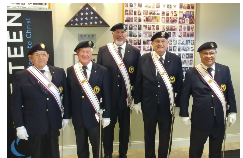
Corpus Christi Santa Maria del Mar