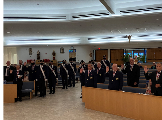
Installation of Officers August 12, 2021