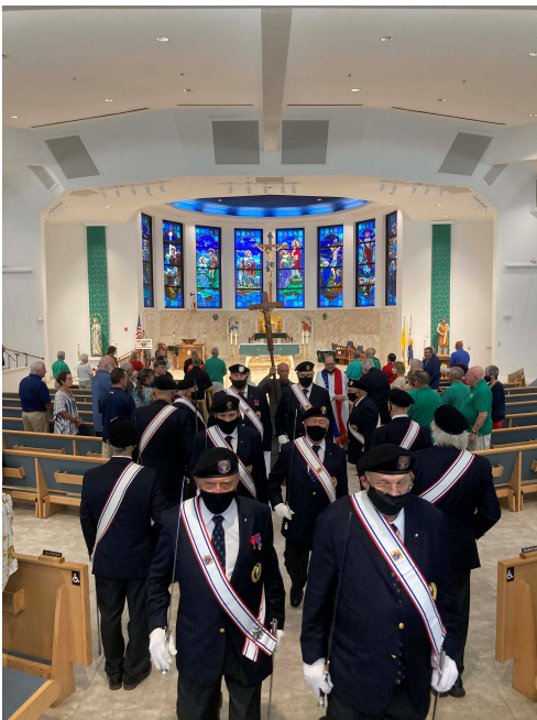
September 11, 2021 Blue Mass Santa Maria del Mar