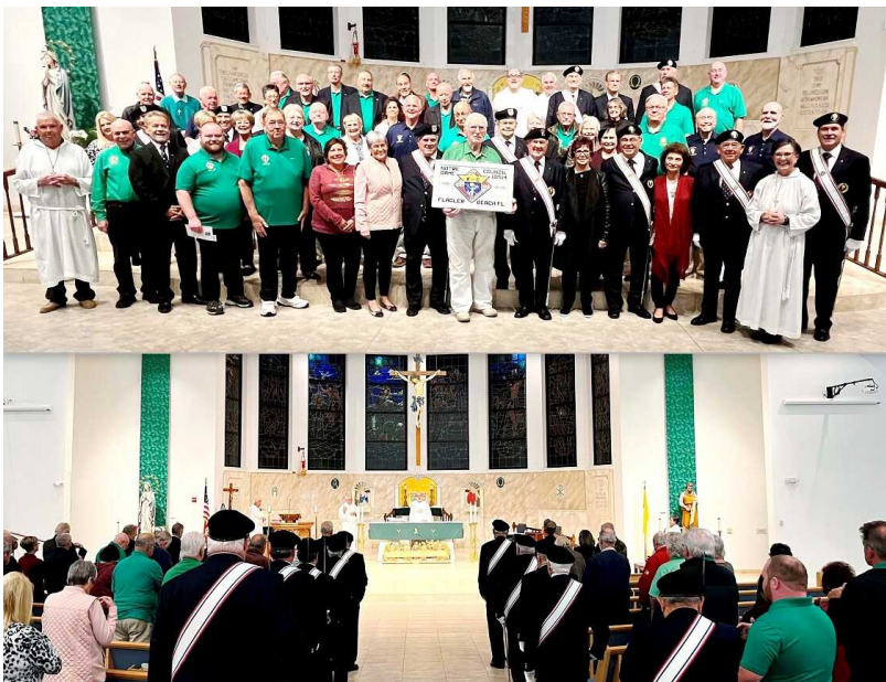
Mass of Remembrance 11/17/22