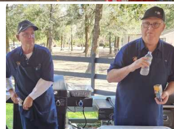
Thank-you Whispering Meadows Ranch BBQ Crew.