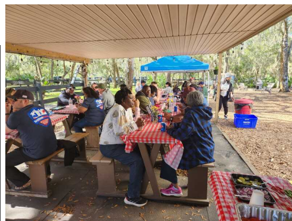
Gratitude America Attendees