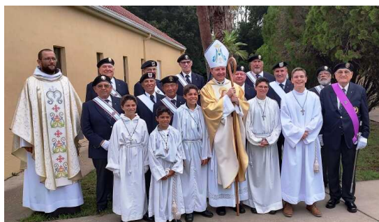
Mass with the Bishop @ St Joseph's Monastery 7-16-23

Assembly Meeting August 15, 2023 Santa Maria del Mar Hall Officers 4:00, Dinner 4:30 Meeting 5:00