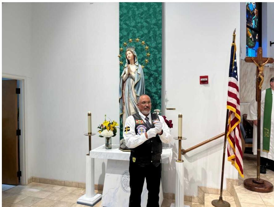
Silver Rose Santa Maria del Mar