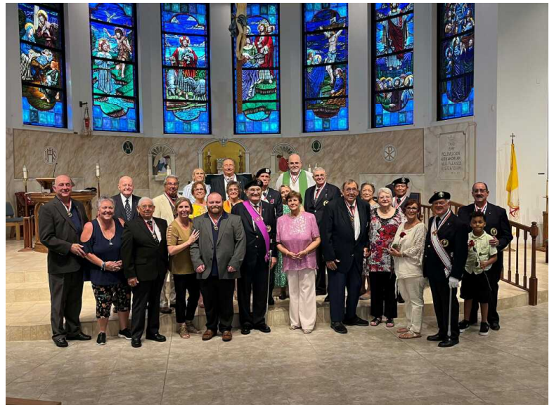
Officer Installation 8/12/23

VA Coffee and Donuts Second Thursday Each Month Signup for a Team