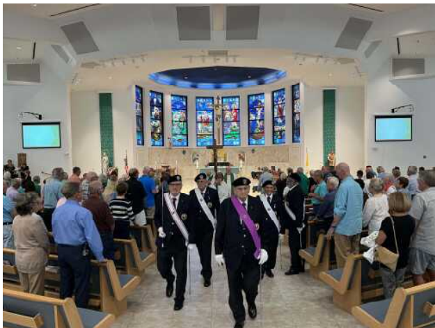
Columbus Day Mass

Respectfully Submitted by SK Frank Consentino, CCC 10-14-23