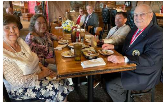
Past Faithful Navigator Dinner