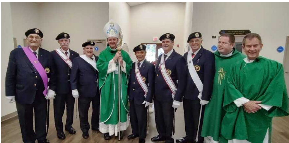
St. Mary's Church in Bunnell on the occasion of a mass with the Bishop in honor of the Nativity of Mary.