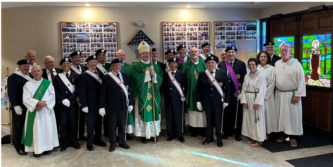
Bishop Mass SMdM