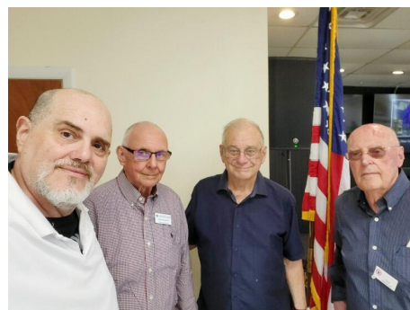
The H. Keith Melton Presentation AFIO, at SMdM