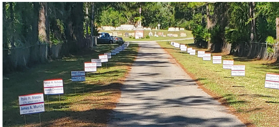
Memorial Day at St. Mary's Cemetery