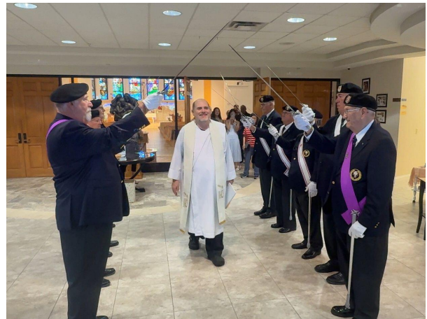
Chen Wedding Photos June 3, 2025