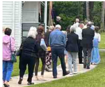
Holy Thursday Walk to the Mother Church