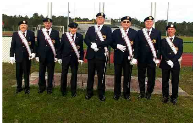
Laps for Life 2022