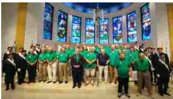
Santa Mar del Mar Council 1054 Living Rosary