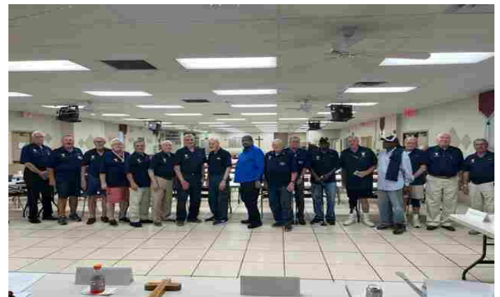
Assembly Meeting Picture

Knights of Columbus Uniforms 230 Supply Room Road Oxford, AL 36203