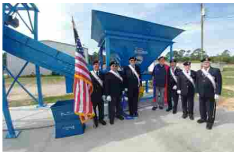
Blessing of Big Blue