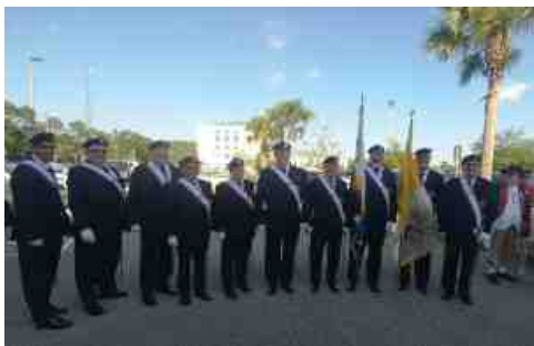
Flagler County Memorial Day Event 5-28-22-2

4th Degree Exemplification June 18, 2022