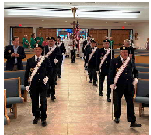
Memorial Day Mass @ SMDM 5-28-22-1