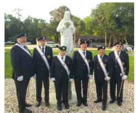
Mass & Procession for Our Lady of Fatima @ Carmelite Monastery 5-14-22-3 (1)