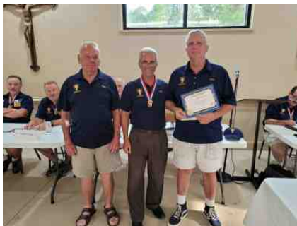
OUR FOOD TEAM