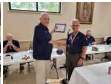
OUR COLOR CORP COMMANDER